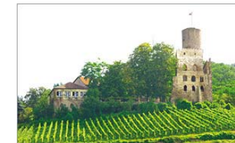
ABB invites the participants for dinner and informal discussions at the Castle-Restaurant Strahlenburg ( www.strahlenburg-schriesheim.de ). The Strahlenburg is 8 km to the west of the workshop venue (10 min driving time).